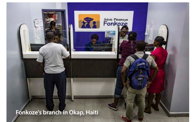
Fonkoze's branch in Okap, Haiti