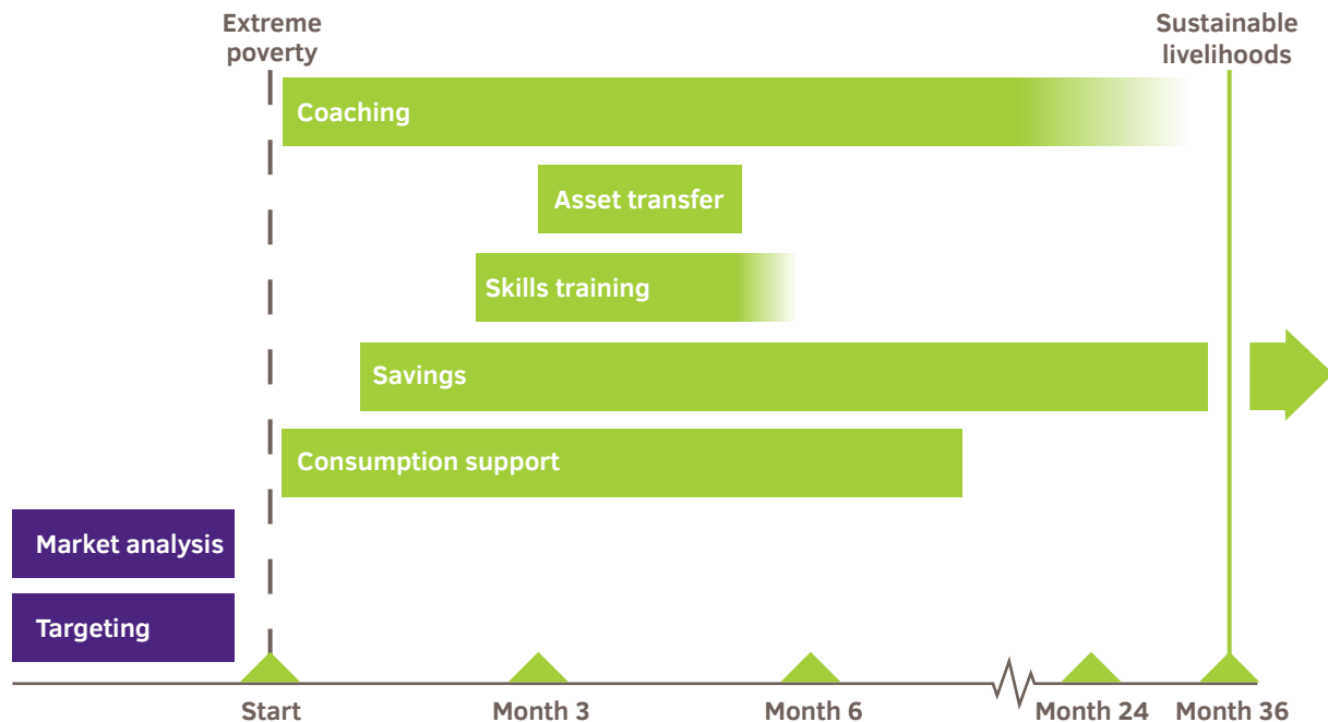
Figure 2. The 'graduation' model